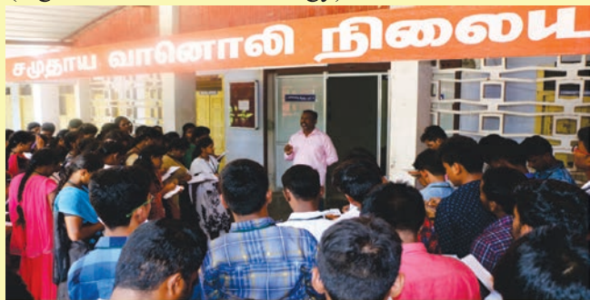
IISWC - VISIT